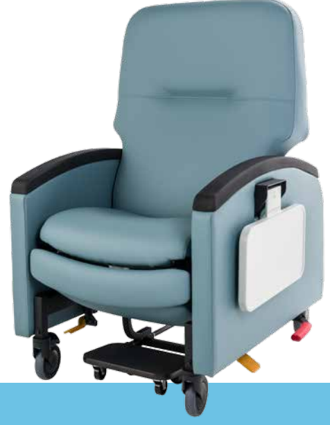
Multiple Positions for Enhanced Patient Comfort