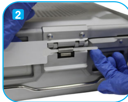
Pass it through the lock section of the container.