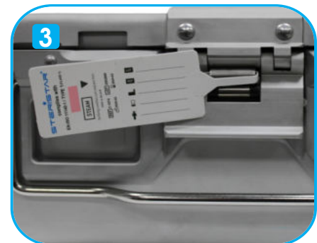
The label is locked with the adhesive feature. For archiving, fill in the corresponding locations on the label.