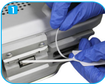
Unglue the tail section on the self-adhesive label.