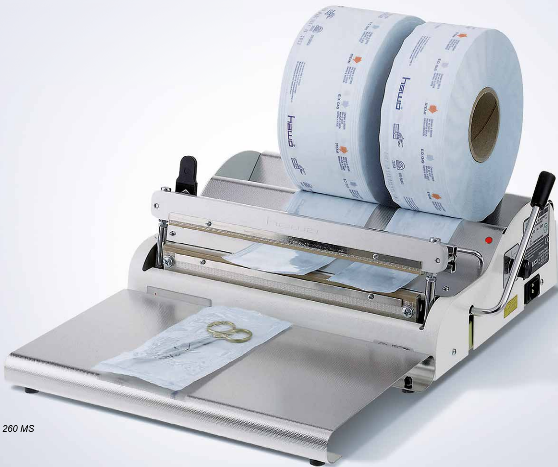
hd 260 MS

The impulse sealers hd 260 MS, hd 270 MS and hd 470 MS are our most economical bar sealers for the packaging of sealable pouches and reels as well as thermoplastic film. Thanks to the adjustable sealing timer the devices can be easily adapted to the material. They are ideally suited for use in smaller institutions and tattoo studios.